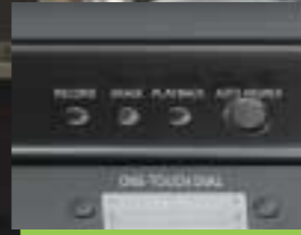
Fully Digital Answering System*