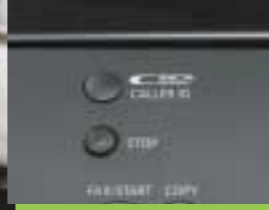
Caller ID*1 Ready