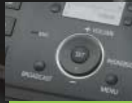
Navigator Key for Easy Operation