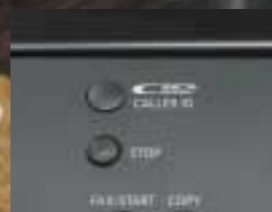
Caller ID*1 Ready